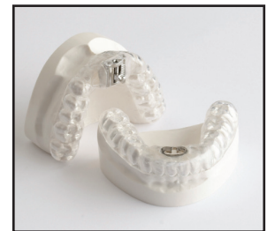
TAP ® 3