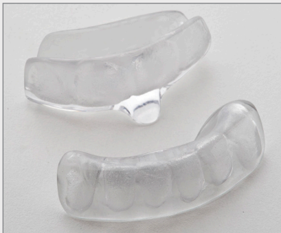
NTI-tss Plus Universal Therapy Set

For more information, please call 800.678.4140