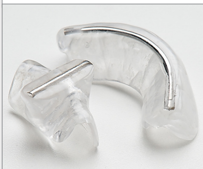
NTI-tss Plus Terminator Therapy Set